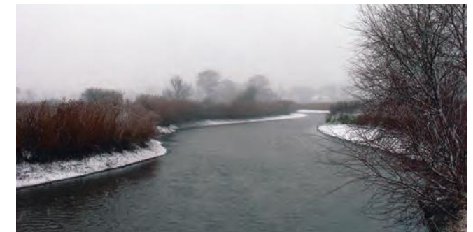
Irpen River in winter.