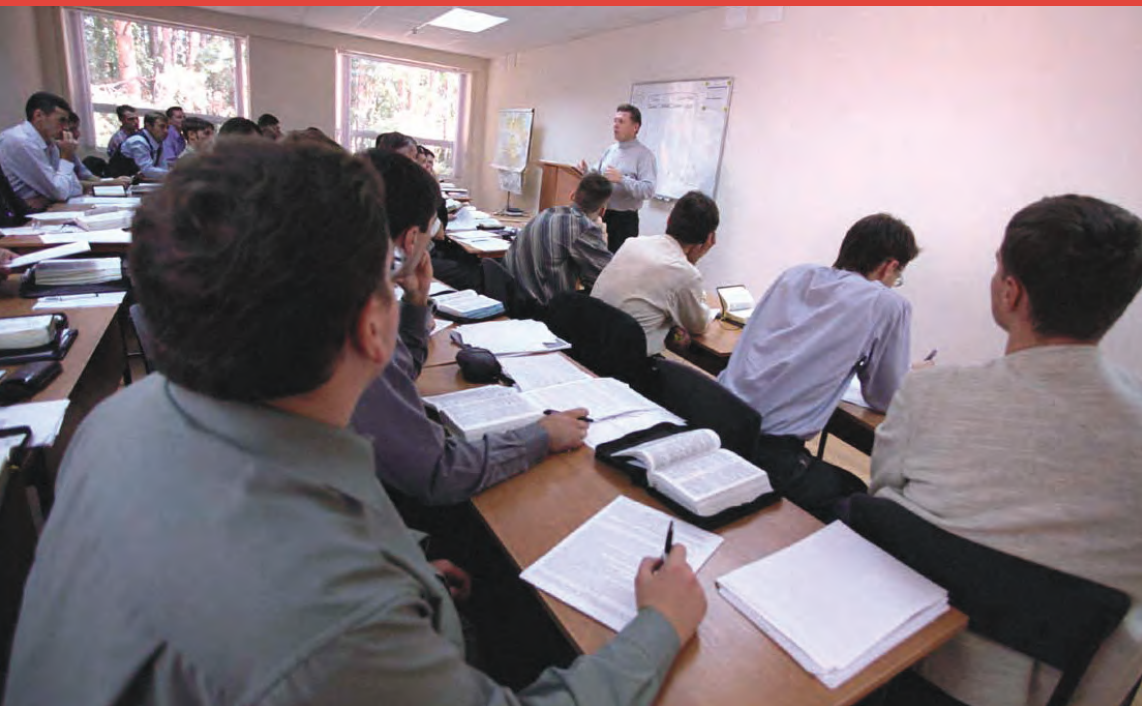
Students benefit from a diverse staff of professors, most whom are of Russian speaking nationals.

(Continued . . . ) are carefully recruited through their local churches, and they are required to be involved in the ministries of their local churches. The goal is to either strengthen their local church or to go out and plant new churches. Past graduates have gone on to dedicated service on the mission field across the former Soviet Union, and in far-away places like Israel and even Muslim countries in the Middle East!”