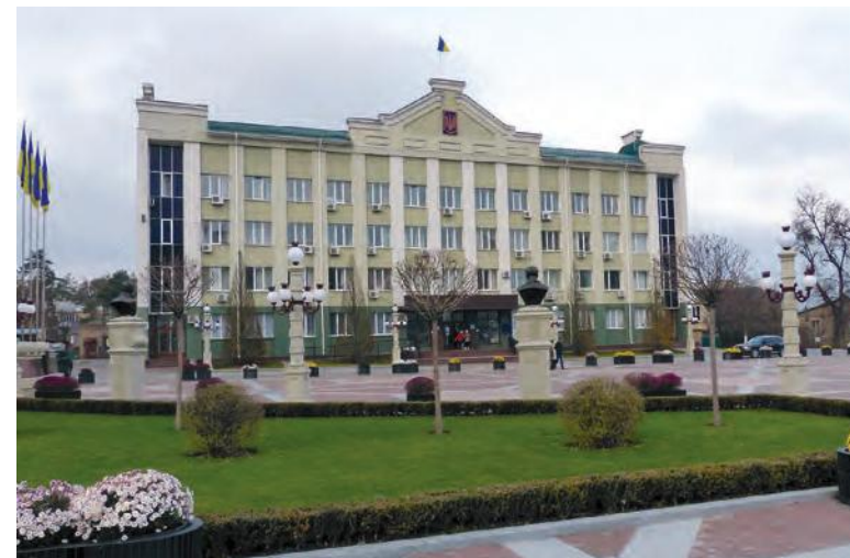
The Irpen town hall.