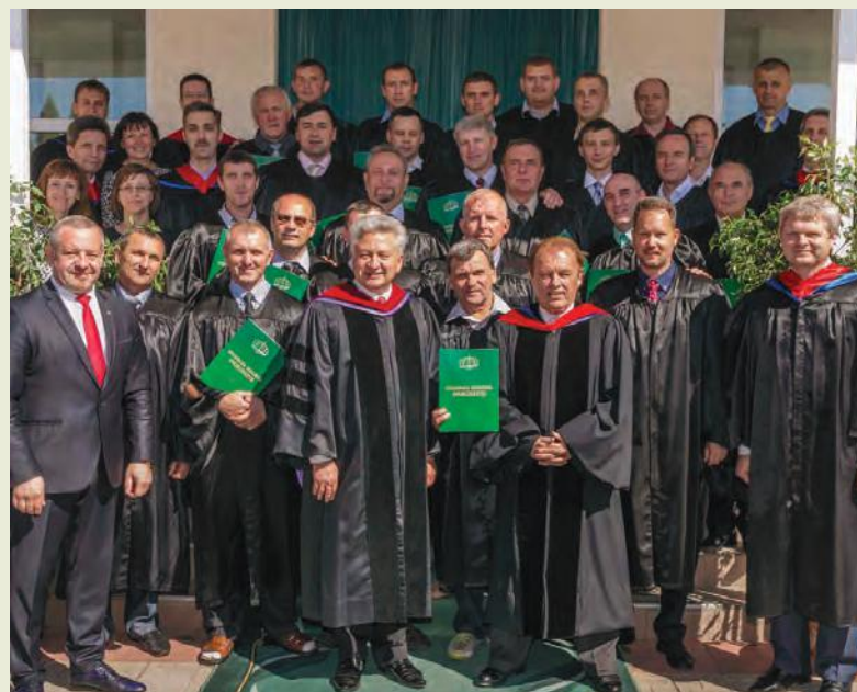
Graduates and staff at the 2017 ceremony.

Thanks to the support of SGA partners, more men and women have been able to access the great educational opportunities that exist at Irpen. Even more would like to be able to study, and the need is enormous with the number of new churches being planted. ♦