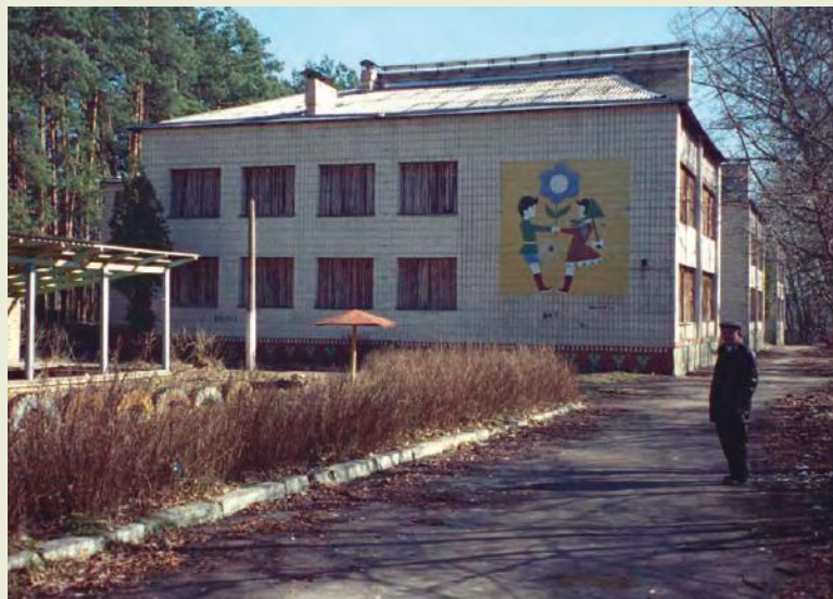
The former kindergarten building, which would be renovated to house the seminary.

This past spring, I found myself on the way back. Back to Ukraine for Irpen's graduation ceremony, I was more than eager to see what God had done over the past 14 years that I had been away from SGA. On my arrival, the atmosphere was one of joy as the students prepared to receive their diplomas. When I had been there before, renovation had just begun on the former kindergarten building that would house the seminary. Today, the beautifully remodeled building that SGA partners helped make possible serves as the centerpiece of the campus. And the Word of