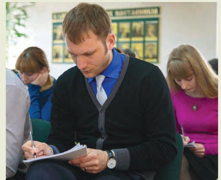
Students at Irpen Biblical Seminary.