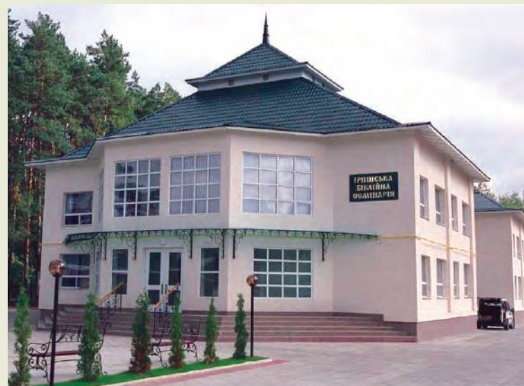
Since the renovation, it serves as the centerpiece of the Irpen Biblical Seminary campus.