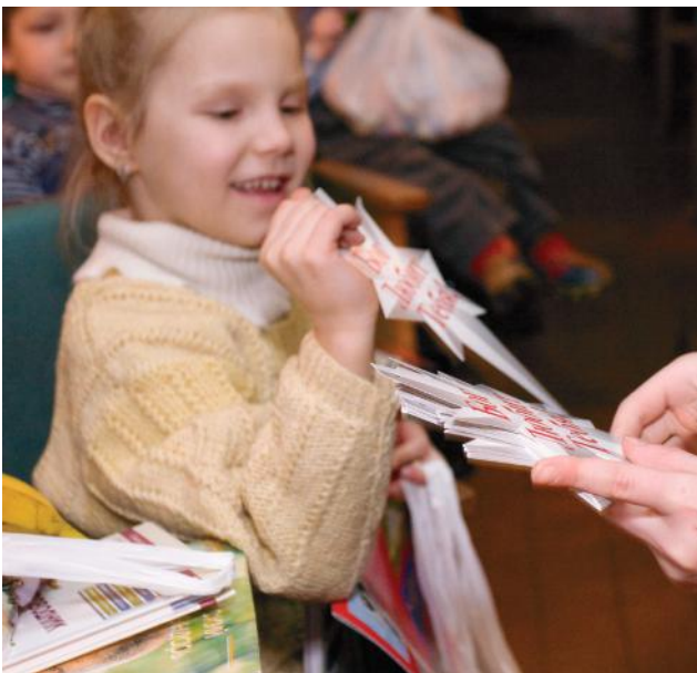
Through your prayers and support we can bring Christ's love to children across the CIS.