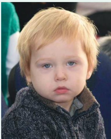
Children throughout the CIS need the hope of Christ.

Since SGA's Reach Russia Now initiative began in late 2017, we have been praying for opportunities to help evangelical churches in the Far East to step up their ministries in this huge unreached region. The Lord answered those prayers in a wonderful way through Immanuel's Child outreaches this Christmas. And not just in the Far East.