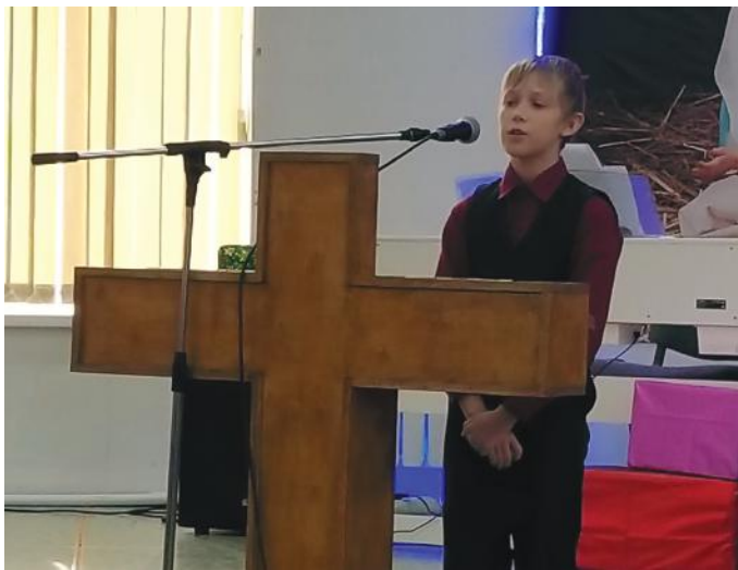
A young man of only 11 years preached at the event.