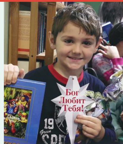
Through Immanuel's Child children learn of God's love.

"It was awesome! The play ended with a message from one of the team members about the true meaning of Christmas. The kids were engaged and the parents were smiling. A parent told us afterward, 'I never