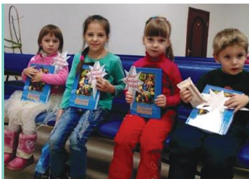
Immanuel's Child in Krasnoyarsk, Russia