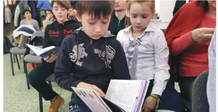
The children learned the Christmas story at the event.