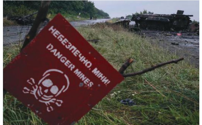
Landmine warning sign in Eastern Ukraine

What you can do: This tragic situation underscores the need to support faithful SGA-sponsored missionary pastors as they deliver humanitarian aid through our Crisis Evangelism Fund , and share the hope found only through the Gospel. Please pray for their safety as they travel across the region, and pray for a peaceful end to the conflict. ♦