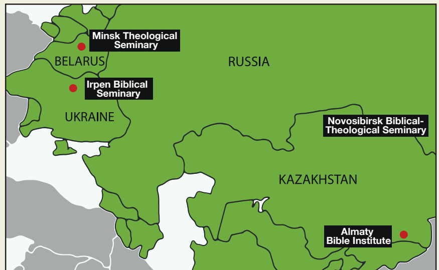
SGA supports 4 biblically sound seminaries in the former Soviet Union.

Thank you for making God's kingdom your priority! And for your commitment to making this truth lived out in the former USSR: " All Scripture is inspired by God and profitable for teaching, for reproof, for correction, for training in righteousness, so that the man of God may be adequate, equipped for every good work " (2 Timothy 3:16-17). ♦