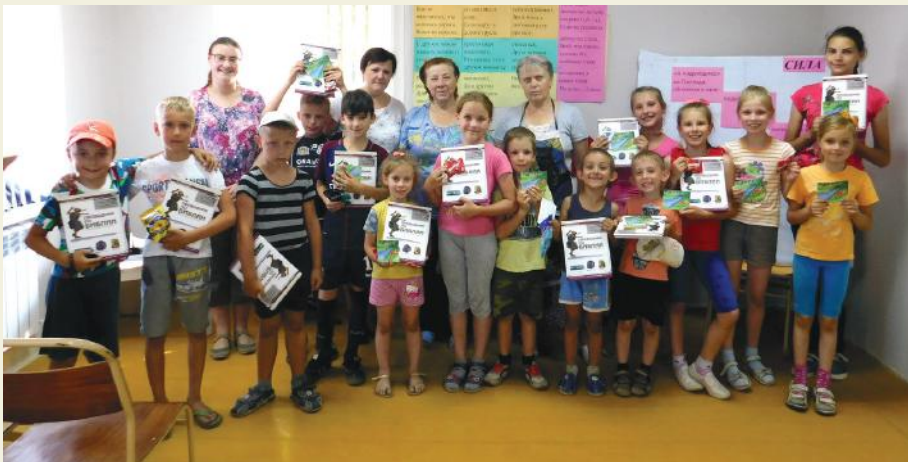
The children enjoyed the Vacation Bible School.

The VBS was held for five days. It rained at first, but we prayed and God answered our prayers with good weather during the rest of our time. We had 28 children take part including five new children. Our program consisted of songs, prayers, learning Bible "Gold Verses," worship, fellowship, and crafts. As we worked with wood at one craft session, I shared the Bible story of how Jesus calmed the storm.