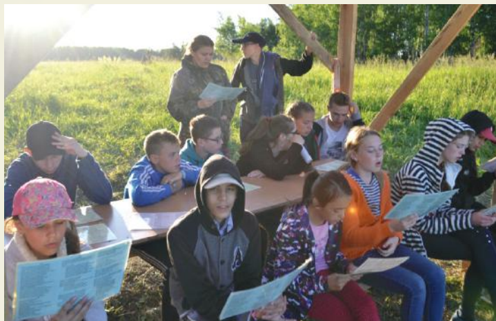
All of the children who attend the camp have "seeds" of the Gospel planted in their hearts.

“Camp always means joy for us. Two of my children went to the camp. This is the only place where I can send my children without fear and worry, as I am sure they will be looked after carefully. They will be taught good things. They experience and witness humility, peace, and a broader outlook in the camp. The children change for the better. I am happy about it