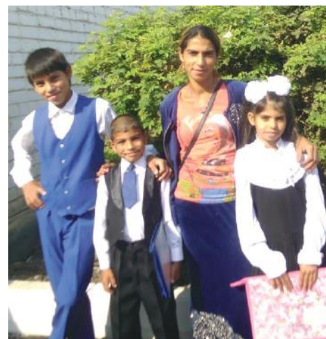
The man's family is grateful for the opportunity to know the Lord.