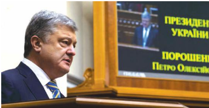
Ukrainian President Petro Poroshenko addresses the country's parliament on February 19.

In a move certain to increase tensions with Russia, Ukrainian president Petro Poroshenko signed a constitutional amendment earlier this year to join NATO and the European Union. While admitting that his country still had a long way to go to meet membership criteria,