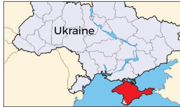
The Crimea region of Ukraine.

While this difficult situation does not directly affect the evangelical churches we serve across the former Soviet Union, increasing political tensions