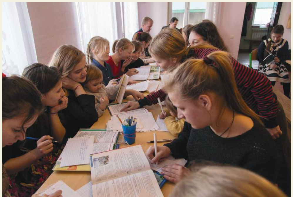
Through Orphans Reborn , orphans throughout Russia are learning about Christ.