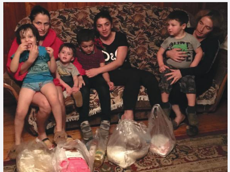
Children and families in Georgia, and throughout the Russian speaking lands, feel Christ's compassion through this ministry.

These are only two examples of how the love of God and your faithfulness is helping to meet enormous physical needs. More than that, this ministry of compassion is opening many opportunities for the life-changing Gospel, and the glorious harvest is eternal! ♦