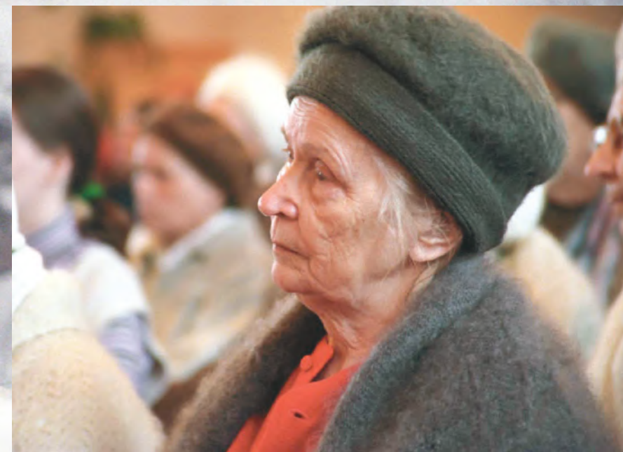
Children and elderly throughout the former Russian-speaking lands need warm clothing and jackets to survive the winter months.

children, orphans, and the elderly who are neglected and alone. In so doing, they are living examples of our compassionate God whose Word declares . . . Pure and undefiled religion in the sight of our God and