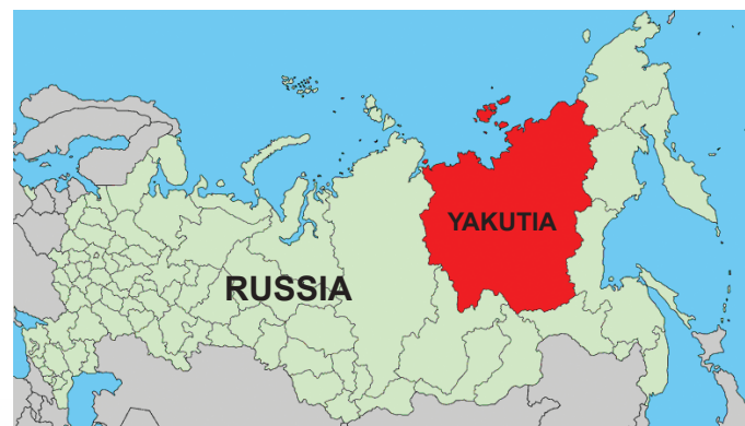
Yakutia (Sakha Republic) is the largest subdivision of the Russian Federation but has one of the least dense populations.