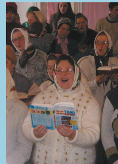
Your support helps make worship possible for so many.

we look forward to reporting on the fruit of Immanuel's Child outreaches, as well as the other SGA-sponsored ministries across Russia and her neighboring countries. Your support helps make Gospel outreach possible for many.