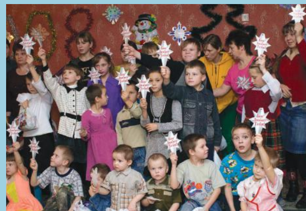
The Immanuel's Child program reaches children throughout the region.

As we begin 2018, our hearts are so deeply thankful to the Lord for what He has done over the past year through your generous support and faithful prayers. In future issues of the Good News Report,