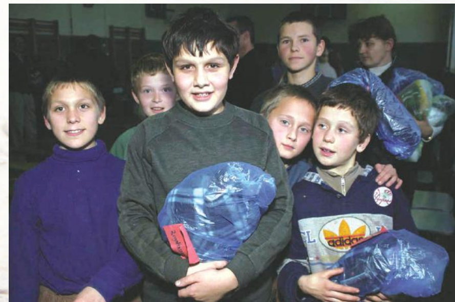
Through your support of Operation Winter Warmth , we are able to put warm winter clothing into needy hands like these.

father is this: to visit orphans and widows in their distress, and to keep oneself unstained by the world (James 1:27). We will update you on this ministry in future issues of the Good News Report. ♦