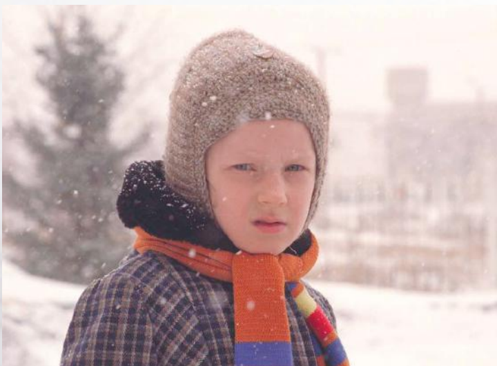
Providing warm clothing and heat is an opportunity to show Christ’s love and compassion to those in need.

In the winter of 2002, Russia was in the midst of a serious economic crisis. Thousands of individuals and families were destitute and uncertain how they were going to survive the cold. To help Russian evangelical churches respond to that great need, SGA launched Operation Winter Warmth with the help of our partners. Tons of warm clothing, footwear, and other aid were placed in the hands of those who desperately needed it, as well as thousands of Russian-language copies of God’s Word. Most wonderful of all,