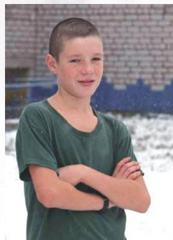
Without warm clothing, this boy’s future is dire.

the Lord used this massive effort to help open the door for SGA-sponsored missionary pastors to demonstrate Christ’s love and to share the Gospel with unbelievers.