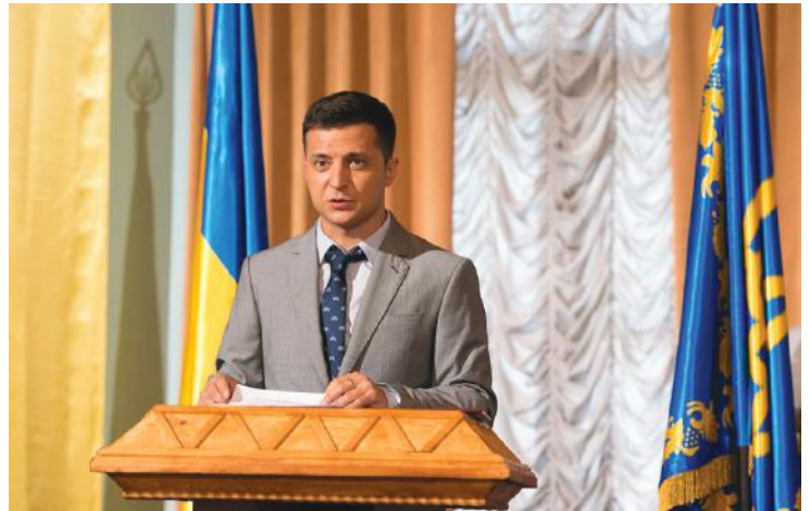
Volodymyr Zelensky, who once played the role of president on television, will now take the office in real life.

for the Gospel would continue for evangelical churches regardless of changes in government. ♦