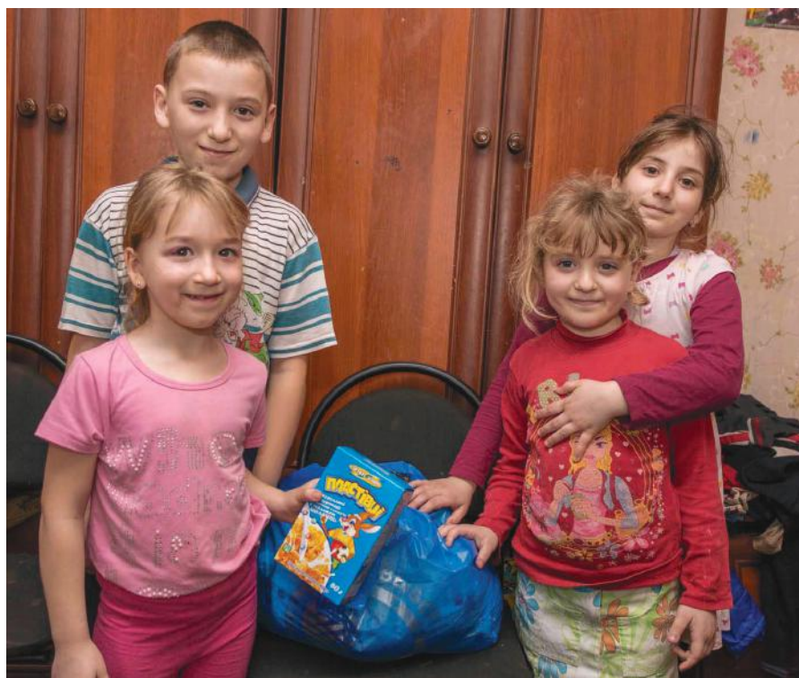
SGA’s Compassion Ministry helps support children and families throughout the nations of the former Soviet Union.