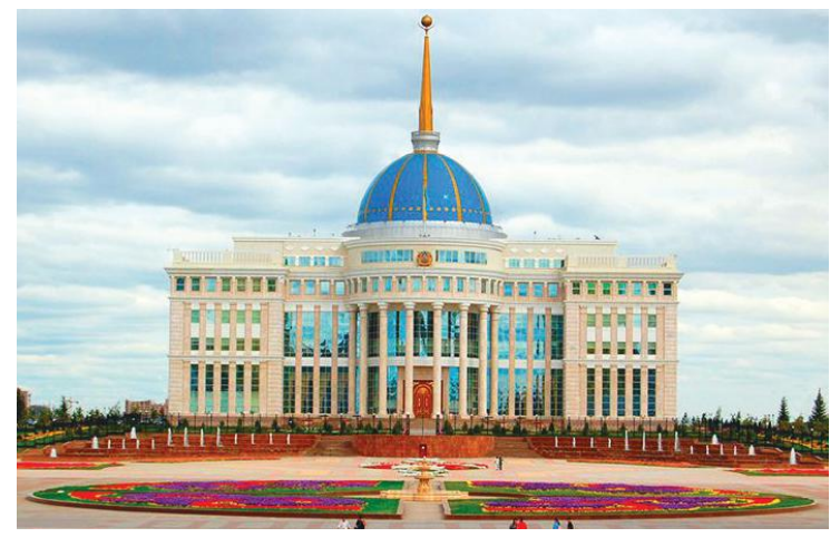
The Presidential Palace in Astana.

Evangelical churches enjoyed a substantial amount of freedom in the initial years after the Soviet collapse, but restrictions and oppression of