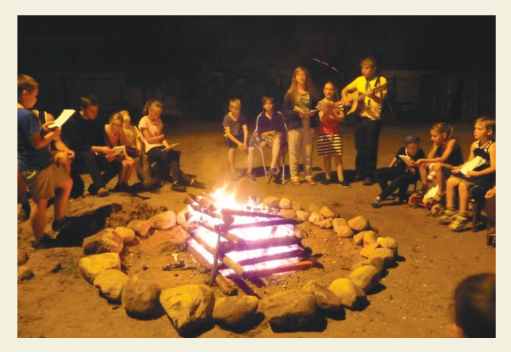
Everyone enjoyed singing by the campfire.

We built a campfire pit in the yard. We sat around it and sang songs. When the seven-day camp ended, the young people continued to come together by the campfire to study the Bible. We sang songs, played guitar, and discussed different topics. I cooked dinner for them in the camp canteen. We continued these activities for two months until the weather became too cold. Now the young people come together in my house for fellowship every Wednesday and Friday.