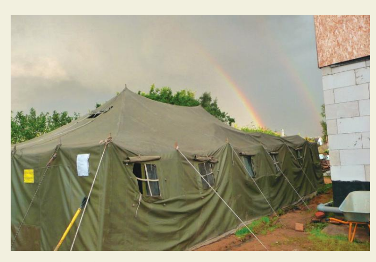
A beautiful rainbow over the campers' tent.

"When the seven-day camp ended, the young people continued to come together . . . to study the Bible."