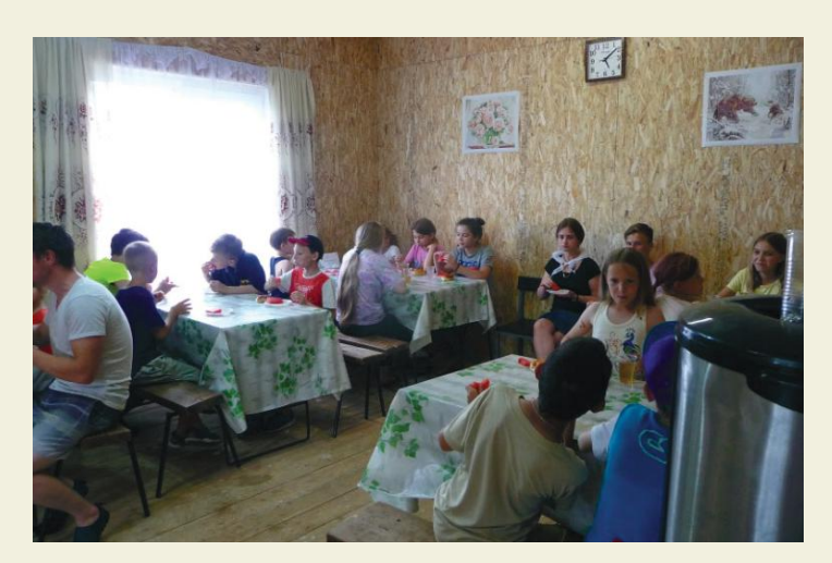
Everyone was able to eat together in the canteen.