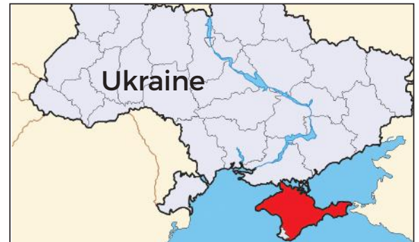
The Russian-annexed Crimea region of Ukraine.

As Crimea is effectively under Russian law now, these prosecutions are taking place using the 2016 "Yarovaya" anti-missionary law that has had