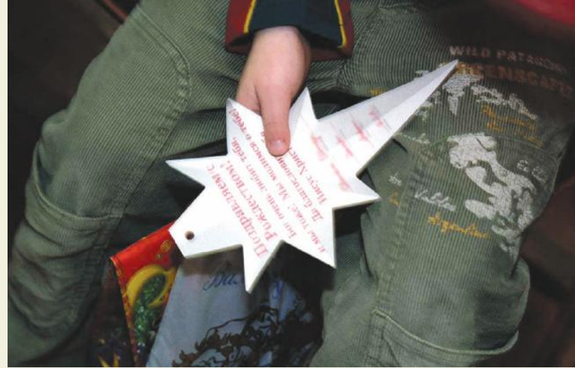
The children particularly appreciate the signed Bethlehem Stars.

Through Immanuel's Child and the year-round ministries of SGA, this dear couple and their church minister to these children who have been forgotten by the world, but not forgotten by God . We praise God for raising up faithful servants in Ukraine and the other CIS nations, and for all those who support