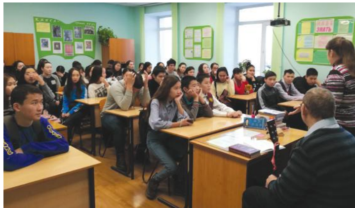
The students learned about Christ's love for them.