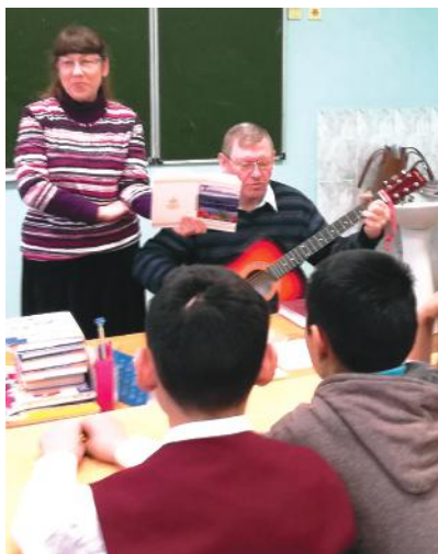
The children were eager to listen to the lesson and the songs.