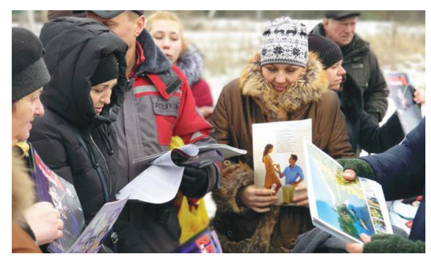
In addition to food assistance, Compassion Ministry distributes Christian literature to those in need.

than 140 homes are beyond repair, while 600 are repairable. Those who could evacuate to other cities have done so. Most of the non-displaced population are mostly older people over 60, as well as people with disabilities or no family elsewhere . . . We are thankful for your continued financial support of Compassion Ministry in Ukraine!