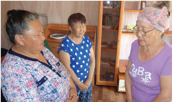
Women pray together during a home visit.

Alysardakh is very small—only 100 people. There's a kindergarten, a grade school, and a local community center. It takes two hours to get there by motorboat. I had opportunities to speak with people in the street and tell them of the Lord Jesus Christ, and that only through faith in Him can we receive forgiveness of our sins. There are several women there who show interest in God. We sent them literature and follow up with them. Pray they will open the door to Jesus!