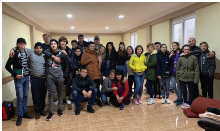
Winter camp for young people.

After summer camp season concluded last year, we cultivated good relationships with the children and their parents. So we decided to hold a winter camp for the youth. We gathered together 16 teenagers between 16 and 19 years of age.