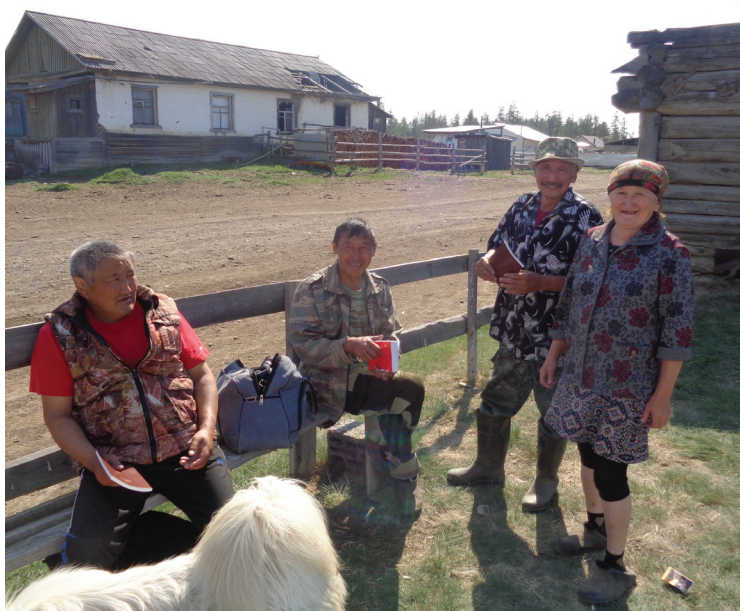
People in a village in Far East Russia show an interest in learning more about Jesus.