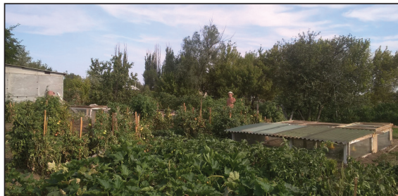
Garden & hen houses at rehab centre in Volgograd, Russia

The first would be the contentment with so little. I am reminded of the passage in Matthew 6:25-27 where Jesus says we are not to worry about basic necessities. He declares that even the birds are cared for by our heavenly Father.