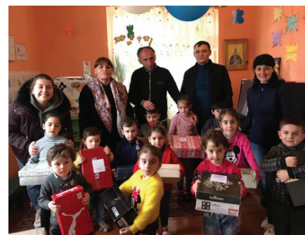
Christmas program at a kindergarten.

Christ in this warm atmosphere! We have already started regular Sunday services in our home. Thank you for participating in our ministry. Praise God! ♦