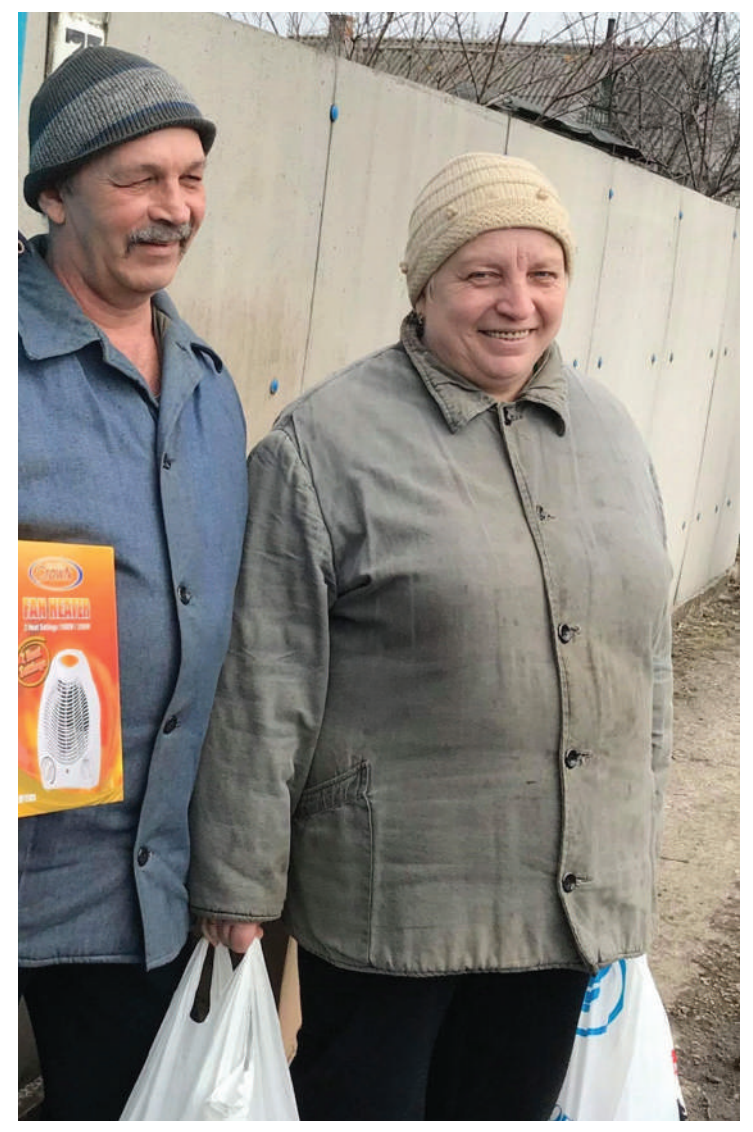
A couple is excited to receive relief packages in Avdeevka.

A swinter's icy grip tightens across the former Soviet countries, thousands of needy individuals and families face serious difficulties. Poverty is rampant in many regions, and SGA-sponsored