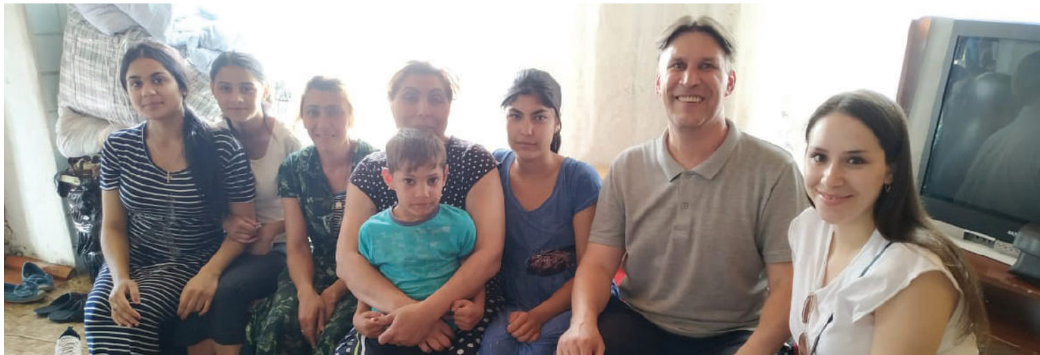
Five Roma families received food packages from the church in Omsk.

Compassion and the Gospel of Christ transform souls in Siberia . . . and beyond!