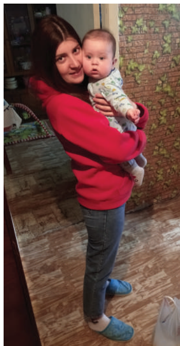
The girl and her baby.

"We minister in one local orphanage and also work with social orphans (children from dysfunctional families). The ministry is very successful and is recognized by many parents. The girl in the photo went to our church for a long time when she was a teenager. She is from a difficult, dysfunctional family with no father around and the mother often drank. When the girl finished school, she left our city and began to live a troubled life. She met a man and gave birth to a child, then the father left her. The child was born with a severe hernia and had to have an operation. As a church, we prayed for the child and for the girl.