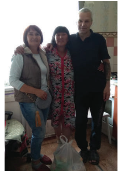
Bringing aid to a needy couple.

that the Gospel seeds being planted will take root and grow, with many coming to saving faith in Christ. And thank you for your part in supporting the Christ Over COVID outreaches! ♦