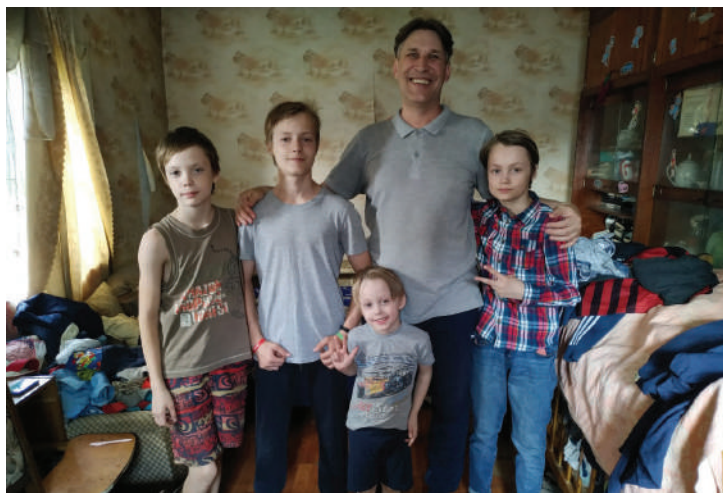
A missionary pastor in Omsk visits a family with four boys.

Tragic events such as the COVID-19 pandemic can be hard to understand as we see the human toll they take. Yet since SGA began the Christ Over COVID prayer campaign and related food distributions to afflicted families, we have seen example after example of how God is at work through His people in the midst of the sorrow. Lives are being changed and souls are being saved as the love and compassion of Christ are on display, and you have been a vital part of it all through your prayers and generous support. As we ended our fiscal year at the end of June, you helped SGA-sponsored missionary pastors and church workers distribute grocery parcels across Russia and her neighboring countries. These food parcels helped provide the equivalent of 1.5 million meals! And as we have shared in our daily email prayer updates that went out to those who subscribed, these food distributions helped open up many opportunities