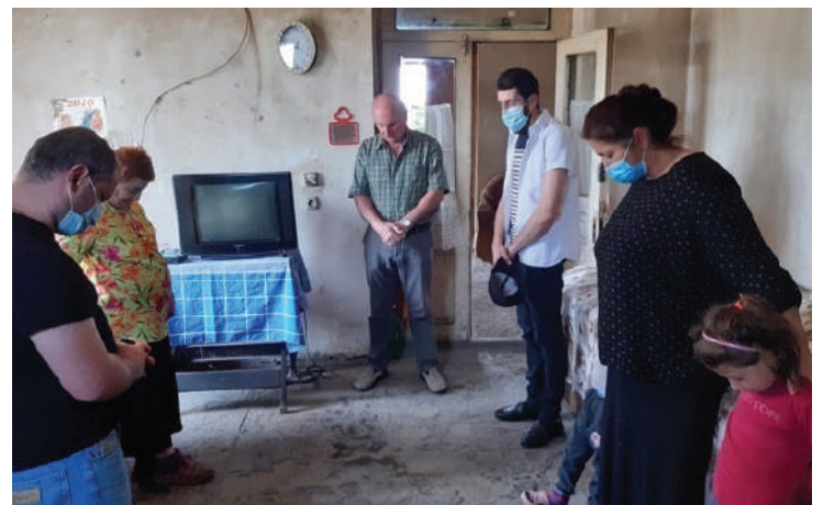
Delivering aid to families in Georgia.

In fact, some time earlier, our prayers for several unbelieving families were answered by the Lord and they will probably share about their blessings with others. Everything that was done could not have been accomplished without your help. Thank you so much! May the Lord reward you in His timing for all the goodness that you render to poor and less privileged families in a mutual effort with us! ♦