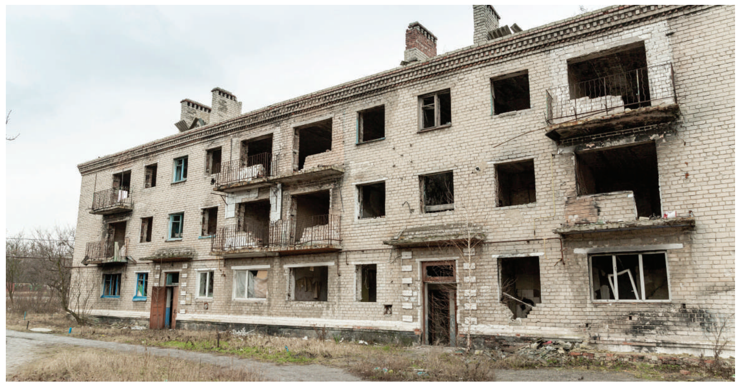
The ongoing fighting has uprooted many families. Apartment buildings and businesses have been completely destroyed.

... that we may be fellow workers with the truth (3 John 8).