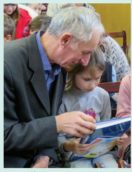
A grandfather and granddaughter look at a children's Bible the young girl received.

Across Russia and her neighboring countries, our brothers and sisters continue to minister and serve in the midst of incredibly challenging conditions. The COVID-19 pandemic is hitting their nations very