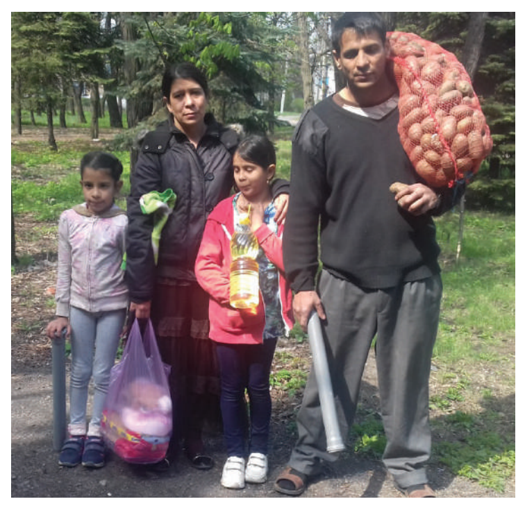
Many families are struggling due to the ongoing war.

fire. In one area, the village gathered at the church including widows and young women with children. Empty churches are filling, and these people would not have heard the Gospel any other way. "