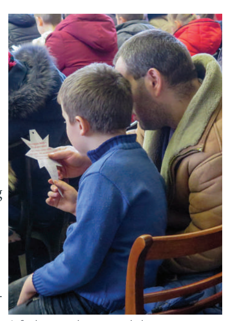
A father and son read the name on an Immanuel's Child star.

churches and children's workers. continue to bear fruit all year long. While the COVID-19 pandemic continues to impact lives across Russia and her neighboring countries, the churches plan to push forward, reaching more children than ever we are asking God for 50,000! But the new interest in