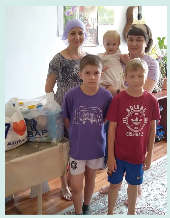
Delivering much-needed groceries to a family with a new baby.

Please pray about how you can help today in sustaining SGA's ongoing ministries! Please use the enclosed reply slip and return envelope to make a gift as God leads. •