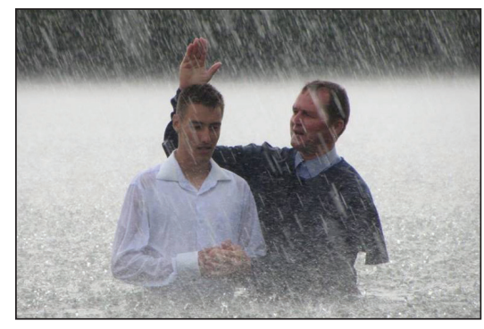
Baptism in Ukraine

Politicians are in a precarious place and definitely need our prayers in leading the countries through the pandemic. Pastors as well need our prayers, but also our practical gifts in order to fulfill their mandate. This issue of Good News Report gives you a small window into the amazing work of God's love being accomplished.