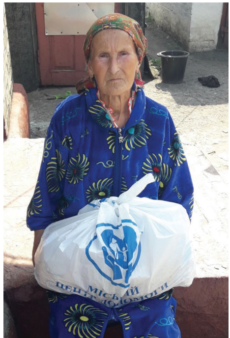
Delivering food packages to widows and needy families in the war zone of eastern Ukraine.