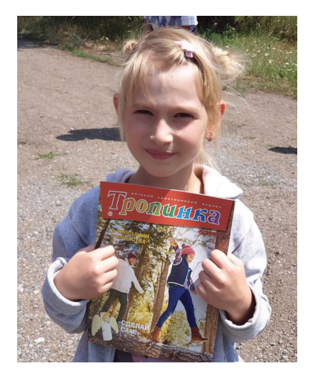
Bringing God's Word to children and their families.

The families were among those who had lost a source of subsistence, disadvantaged families and widows. Most of them have no family and are not even able to get to a grocery store. Your support has been