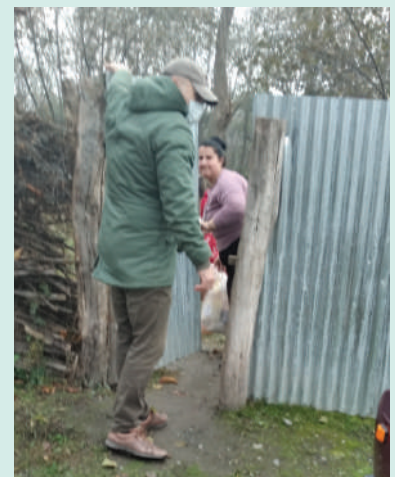
Delivering aid to an Azeri family.

It is a new year, and its arrival brings many new needs and ministry opportunities for the evangelical churches SGA serves across the former Soviet Union. Whether it is food aid for needy families impacted by the COVID-19 pandemic, help for war refugees in the Nagorno-Karabakh region or eastern Ukraine, or meeting individuals and families in regions where the Gospel has never been preached, your faithful support