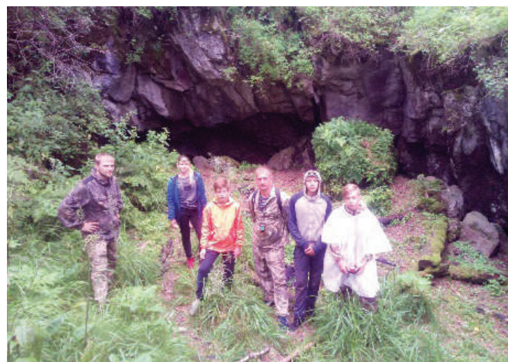
Top and Above: Walking trip with children.

our walking trip, for our spiritual meditations, we read the story of Esau and Jacob. We showed the children how in pursuit of earthly goods