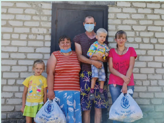
Bringing food packs to a family in the Ukraine war zone.

continues to have eternal impact. You are helping to provide Russian-language Bibles and Christian literature, theological training for pastors and church workers, ministry to orphans and other needy children, resources for planting new churches, and so much more. Please pray about how you can help today! ♦