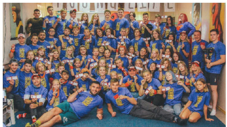
Top and Above: Teenage camp in Novokuznetsk.

Due to quarantine many events were cancelled, but the work that the Lord entrusted to us could not be either stopped or cancelled. Thank you for your support and prayers! ♦