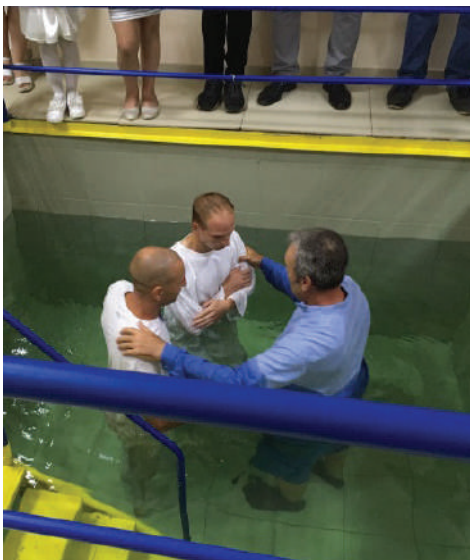
Top: Family camp; Above: Baptism

events, and witnessed to unbelievers, and as for our family it was both recreation and ministry!