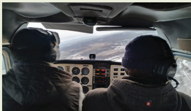
The first flight.

By the time we moved, missionary aviation had already become a reality in Far East Russia, and I supposed that I would smoothly blend into the work of the ministry and it would only continue to grow in its effectiveness. Contrary to my expectations, shortly before we arrived, the operation in our local region had stalled. The annual certification had lapsed on both aircrafts and we found ourselves in an uphill battle to get the airplanes back in the air. Shortly after our arrival, several significant changes were introduced into the federal aviation regulations. The changes affected the following areas: the classification of our aircraft, the engine and propeller time, and calendar limitations. In short, every part of the aircraft was affected by the changes of the new regulations. What made the new process even more difficult, was the confusion on how to implement these new requirements on the level of the local aviation authorities. Everyone was confused and it took time to