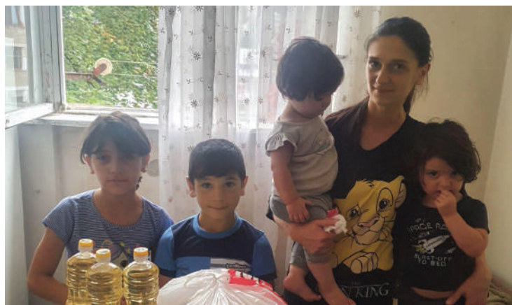
Bringing food packs to a family that moved from Nagorno-Karabakh to Armenia.