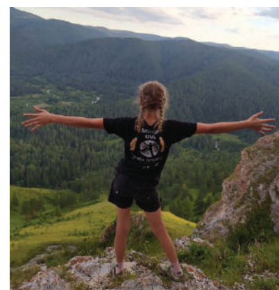
Exploring God's creation during the walking trip.