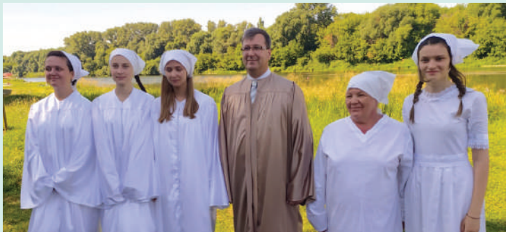
At the baptism service.

One of our sisters in the Usman church gave her unfinished house to the church as a gift. There are several Christian families in the village, and we held the first worship service with them in July. We prayed, asking the Lord to bless the construction that would now take place, and He did! We began cutting grass and cleaning up garbage. We also invited local believers to take part in fundraising for the church construction. Progress has been made and Bible studies are now being held there. We also held a baptism service, with eight people publicly declaring their faith in Christ and a celebration afterward.