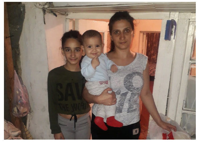
Bringing groceries to a family in Armenia.

There are many other reports coming in from this troubled region—reports that are wonderful examples of how your prayers and gifts are making a difference as shattered families receive help in the name of Jesus. Please continue to intercede for our brothers and sisters!