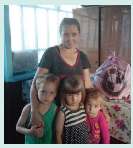
Compassion ministry in Ukraine.

How blessed is he who considers the poor; the Lord will deliver him in a day of trouble (Psalm 41:1).