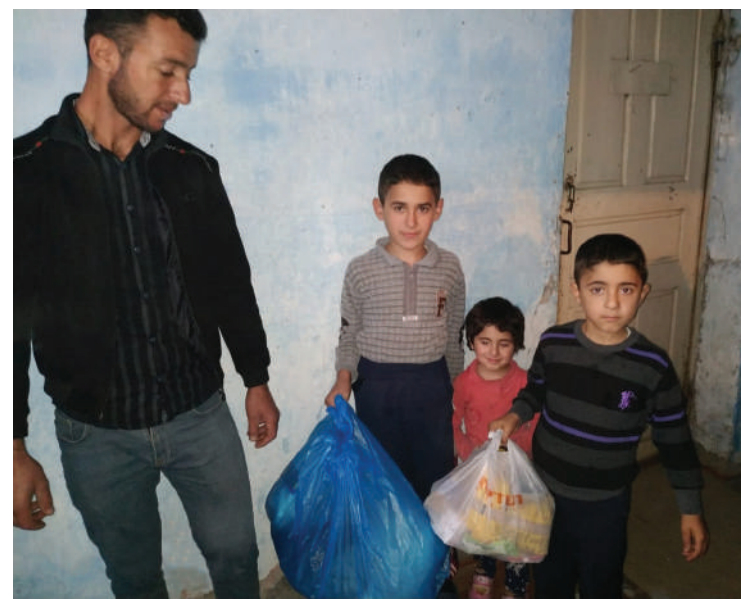
Delivering food packages to needy families.

When you add the COVID-19 pandemic into the equation, the need, heartbreak, and tragedy only increased. It is into this great sorrow that SGA partners helped evangelical churches in both countries step in to bring comfort, urgently needed humanitarian aid, and the hope of the Gospel. Between April 2020 and January 2021, evangelical churches distributed enough food to provide 77,263 meals to needy families impacted by