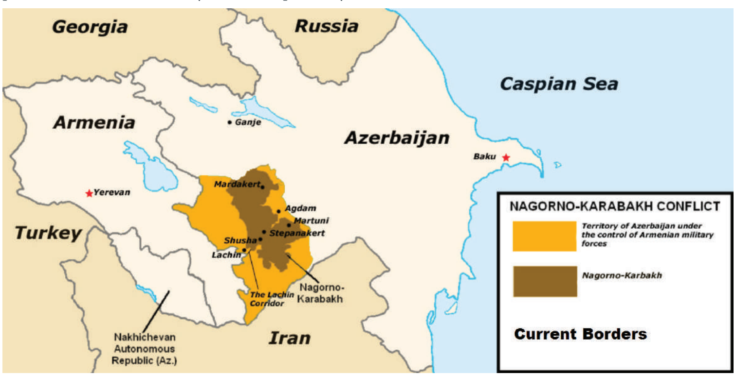
The disputed Nagorno-Karabakh region between Armenia and Azerbaijan.

the pandemic, and later the war refugees. The food packages also contained items such as shoes, blankets, and some medicines.