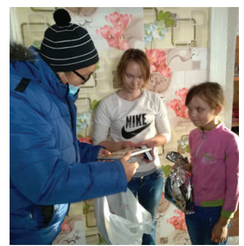
The children were delighted to receive the Christmas presents.

also included Christian books and the Star of Bethlehem ornament. We praised God for His provision, and it shows that even though we live in countries far from each other, we are near and close as one family united in His name!