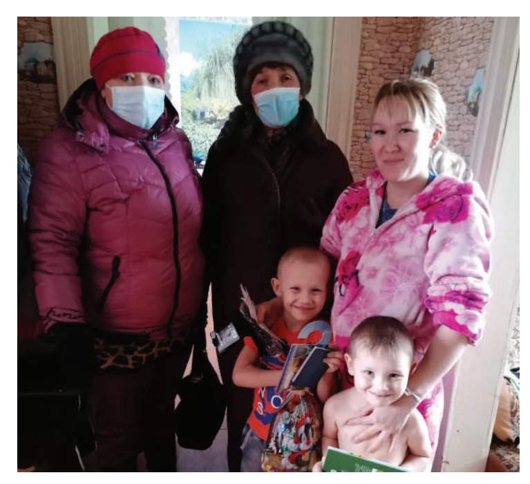
Delivering Immanuel's Child gifts in Bokhan.

Your gifts support new Immanuel's Child and family outreaches