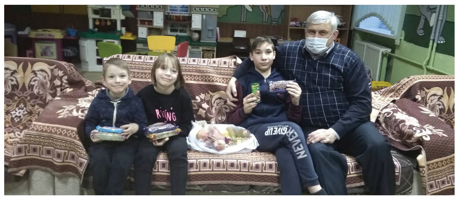
The Orphans Reborn team regularly visits orphanages to minister to the children.

SGA-Supported Orphans Reborn Ministry in Belarus