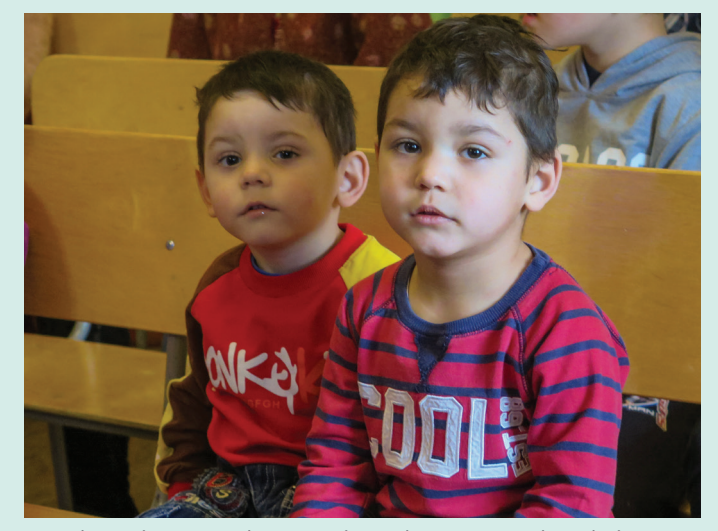
Two boys in an orphanage in Belarus attend a Christmas program prepared by an Orphans Reborn team.

More than that, they continue to amaze us as we see how God is working in these loneliest and most broken of children to redeem them and bring them to Himself, rescuing them out of a hopeless future. Never underestimate the part you play in it all, as your prayers and faithful support undergird all that we do. Not just in Orphans Reborn , but in Bible training, Compassion Ministry , sponsorship of missionary pastors, provision of Russianlanguage Bibles and Christian literature, and so much more. Thank you! And please pray about how you can help today! •