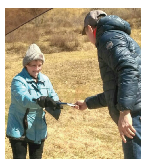
Handing out New Testaments in Radde.

conversations, and some of the people were willing to come to meetings later. We praise the Lord for the work He is doing in seeking and serving people. Thank you for helping us in our ministry in the Far East of Russia! \blacklozenge