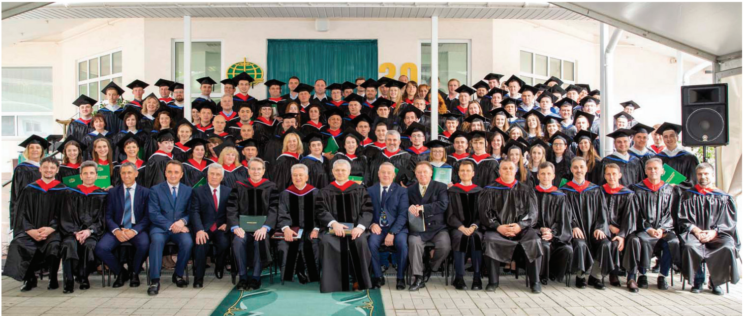
Graduation ceremony at Irpen Biblical Seminary in the spring of 2021.

old, I went to a meeting where the pastor opened the Psalms and said that God was worthy of praise and that we need to glorify Him. That day, I learned about God's greatness and the right way to glorify Him. The pastor called us to glorify God. I asked His forgiveness for not meeting His standards. I just praised Him for the greatness I saw in the book of Psalms, and I thanked Him because He is my Lord. The prayer ended, and the pastor took me by the shoulder. He asked me, "Do you know what just happened?" I was terrified because I thought I did something wrong in my prayer. The pastor told me to follow him, and we walked into the sanctuary. He said to the church, "Brothers and sisters, this dear soul just confessed that Jesus is his Lord and Savior!" The church said, "Hallelujah!" When I turned 21, I was baptized.