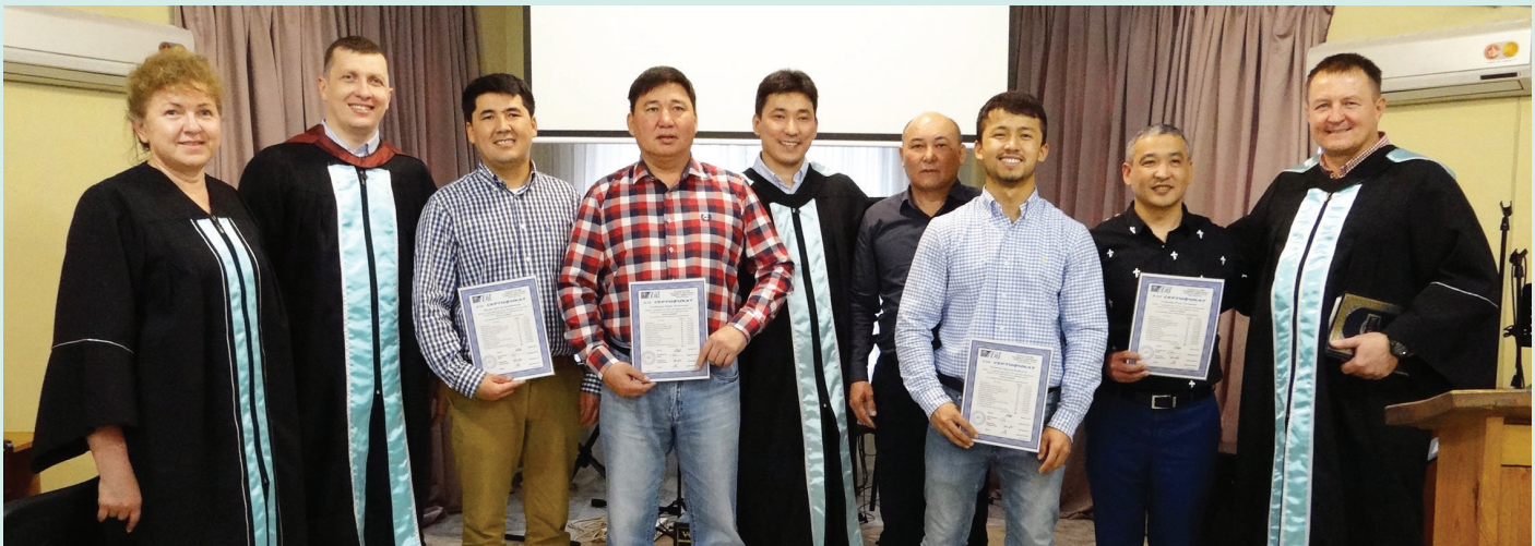
Students and teachers from Almaty Bible Institute.

One thing we have seen repeatedly is that solid Bible training and fruitful ministry go hand in hand. For many years now, SGA has had the great privilege of sponsoring Irpen Biblical Seminary in Ukraine, Minsk Theological Seminary in Belarus, Novosibirsk Biblical-Theological Seminary in Russia, and Almaty Bible Institute in Kazakhstan. These schools help train pastors and workers for advancing the Gospel in their home regions.