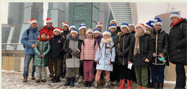
Trip to Moscow with the children.

Our children had a surprise in January—a trip to Moscow. The children were very happy as many had never been to Russia's huge capital. Several had never traveled by train. Churches in Moscow helped us to make this a reality. While there, we had Bible meetings, visits to Red Square and the Aqua Park, the Moscow Experimental Center, and many other activities. Also in January, I had the opportunity to visit the village of Sobolevo to meet with Christian youth from Ivanovo, and to reach other youth with the Gospel. We were able to share the true meaning of Christmas and the Lord Jesus—the Savior of the world. The following month, we visited Sochi for a workshop on Christian children's camps during the summer. We learned much and received certificates after completing the workshop.