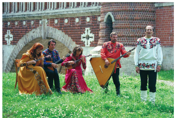
Blagovestie has performed around the world.