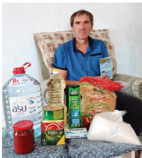
In addition to delivering bottled water and groceries, the outreach is an opportunity to bring the Gospel to those in need.

We want to enable each local church to provide up to 60 food packs a month for needy families impacted by the drought. These packs can contain food, and other items such as water, medicines, and other help. Please pray with us for God to open hearts for the Gospel as these families see His love and experience His gracious provision. ♦