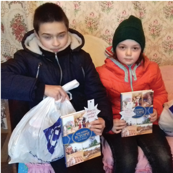
Unable to attend Christmas celebrations because of the pandemic, some children were visited at their homes.