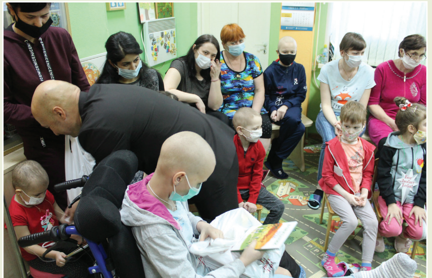
Immanuel's Child helped bring Jesus and hope to a cancer center in Voronezh.