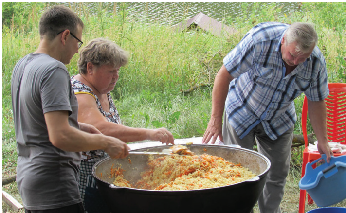
It takes a large pot to cook for 160 campers!

concerned whether we would be able to have an agreement with the resort center because of the pandemic, but it worked out with your help.