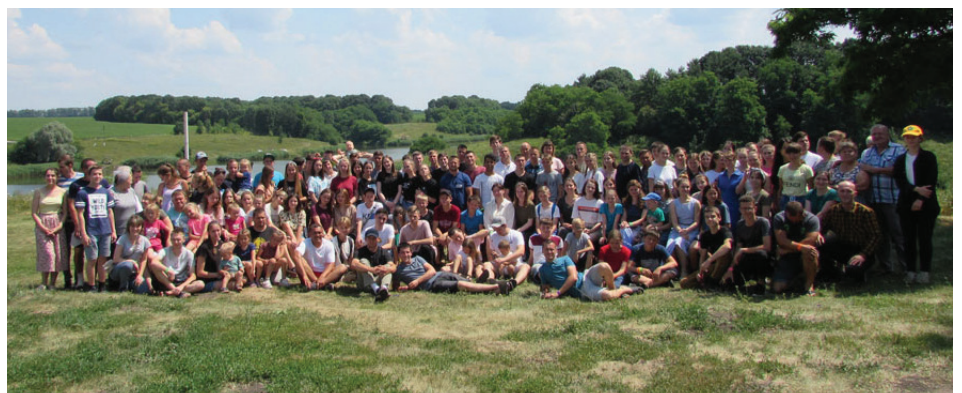
The camp was held in a beautiful area by the Seversky-Donets river in Belgorod.

We thank God for you, for your support, and for your prayers that helped us with this outreach and bringing glory to Christ. Pray for the Gospel seeds that were planted to take root and grow! ♦