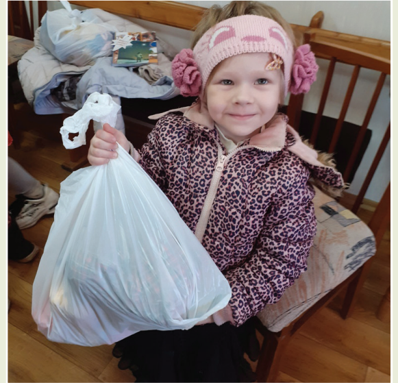
More than just presents, she leaves with a big smile and the gift of Jesus!