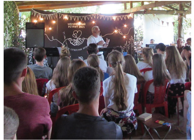
Campers were treated to activities, fellowship, and given the opportunity to hear the Gospel.

We realized that we would have issues providing meals for everyone, but it was a true blessing. We brought two large cooking pots and wood. The cooks prepared meals three times a day for three days. Each day was filled with activities. We had