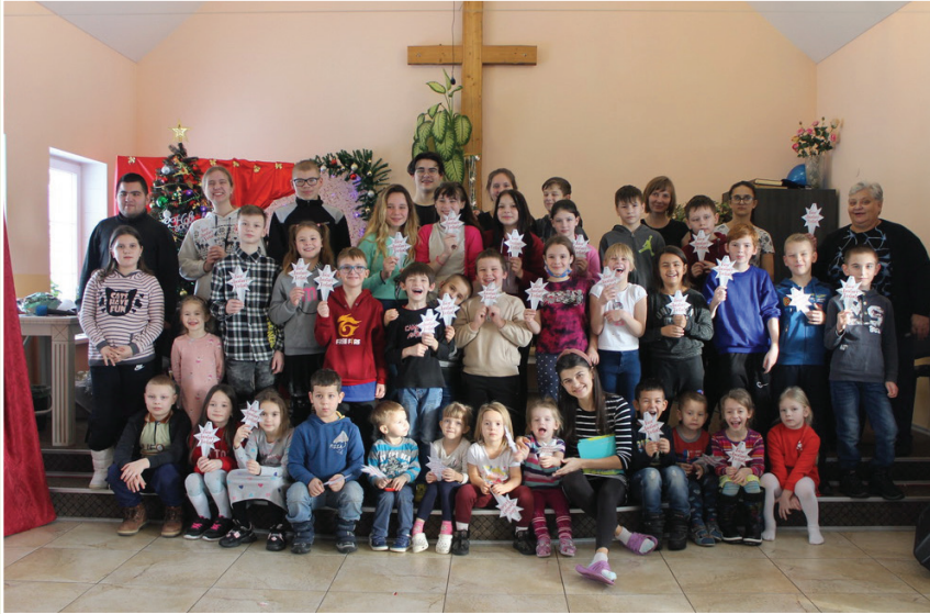
The children received gifts, Children's Bibles, and their much cherished Bethlehem Stars from North American supporters.