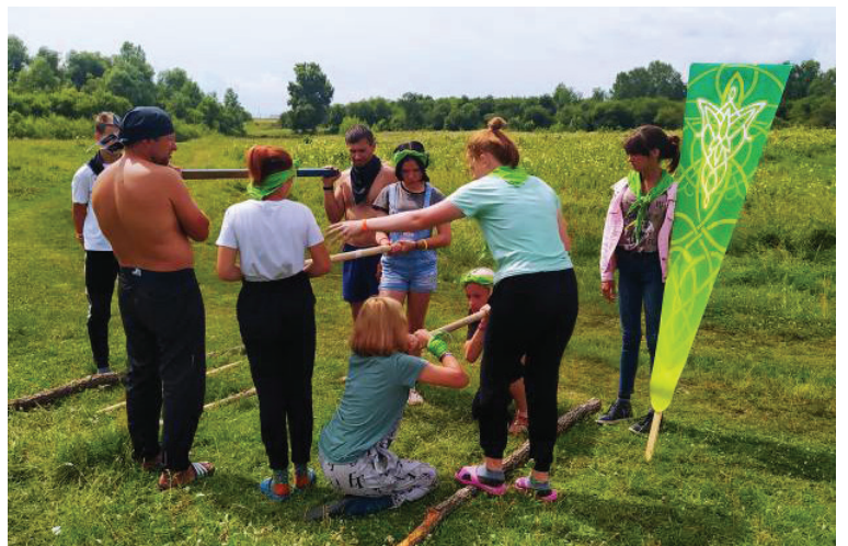
Orphans Reborn teams plan many outdoor activities for the children.

impossible to help them in our own strength, but what is . . . impossible with man is possible with God (Luke 18:27). We keep inviting older orphans to