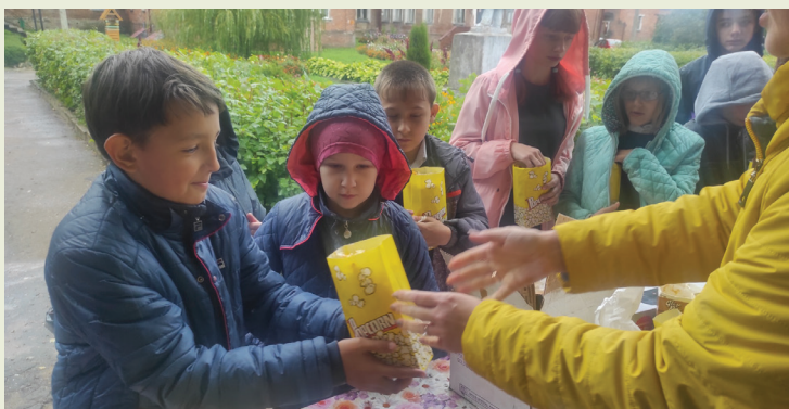
Popcorn snack for the orphans.

SGA-Sponsored Orphans Reborn Team Smolensk, Russia