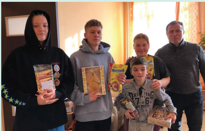
An Orphans Reborn leader brings gifts for the children in the orphanage.

What a wonderful blessing it is to see God at work changing the lives of young orphan children across the former Soviet Union! Whether these boys and girls are young pre-teens or older orphan "graduates" now trying to make their way in the outside world, the faithful churches that SGA serves are committed to reaching them with the life-changing Gospel.