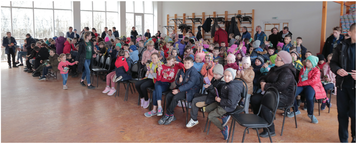
Hundreds of people were reached through the performances.

that people remembered her because of her kindness to her mother-in-law Naomi. And God rewarded Ruth. She became the great grandmother of the king. She also became a part of the Christmas story. Joseph and Mary were descendants of Ruth and Boaz. They came to Bethlehem because that was where the family estate of Ruth and her husband was.