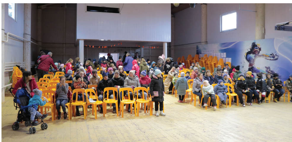
Children and their parents gather for the drama performance.

SGA-Sponsored Orphans Reborn Team in Volgodonsk, Russia