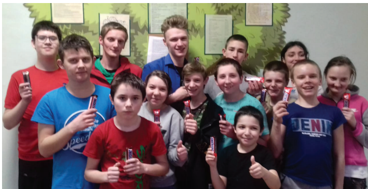
The children with their chocolate bars.

In late March, we were invited to come to Taganrog again to minister to refugee children.