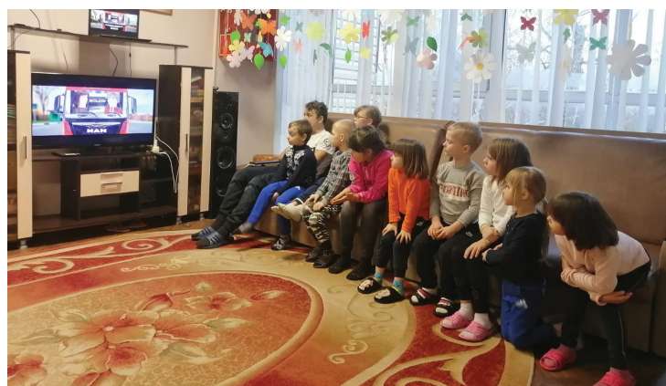
The children at the orphanage watch the recorded drama with interest.

It is about a girl who married and then was left a widow with her husband's parents. She fled from that home and from these elderly people who were not her blood family. She hitch-hiked and that was how she met a long distance truck driver. He listened to the young woman's story and shared with her the story of Ruth from the Bible. Then he brought into focus the fact