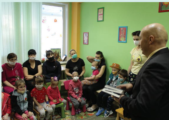
Bible lesson at an orphanage.

The SGA-supported Orphans Reborn outreach across the former Soviet Union continues to be used by God to make an eternal difference in thousands of young lives. The past few years have seen many challenges and hurdles, from the COVID-19 pandemic to the awful war in Ukraine.