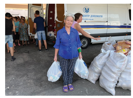
An SGA-supported team provides aid to people in Ukraine.

refugees with aid and the Gospel as God provides. Please pray with us for peace to come at last to this war, which has now raged for six months. •