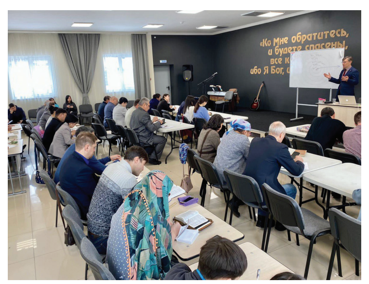
Forty-five men and women participated in Antioch Initiative training in Tuva.

Due to the invasion of Ukraine, we were unable