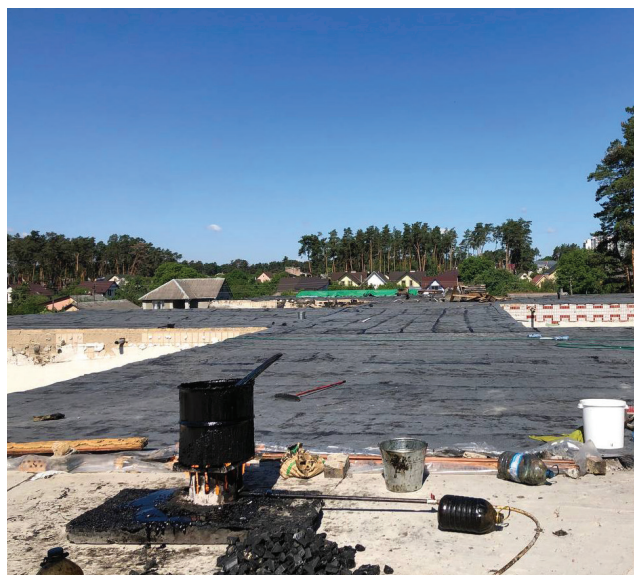
Irpen seminary was hit by 50 mortar rounds, but with the help of volunteers, the debris has been cleared and the roof sealed.