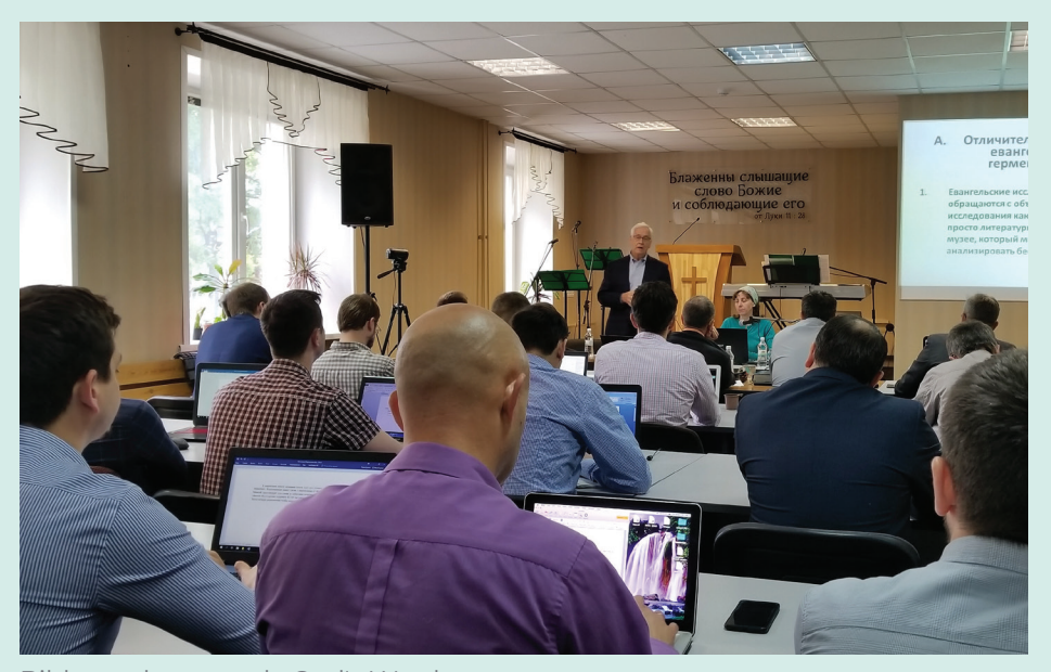
Bible students study God's Word.

To this day along with fulfilling the Great Commission, Bible and theological training remains the top priority of the evangelical churches we serve across the former Soviet Union, and we are so deeply thankful. Your faithful support for in-country seminaries, Bible institutes, the Antioch