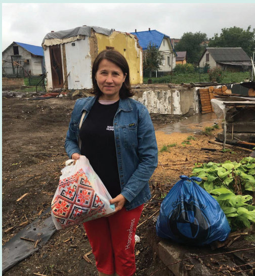
A Ukrainian woman receives aid through SGA-sponsored Compassion Ministry.

The reports and testimonies regularly sent to us by faithful SGA-supported missionary pastors across the former Soviet Union never cease to inspire us and encourage our hearts. They have always faced