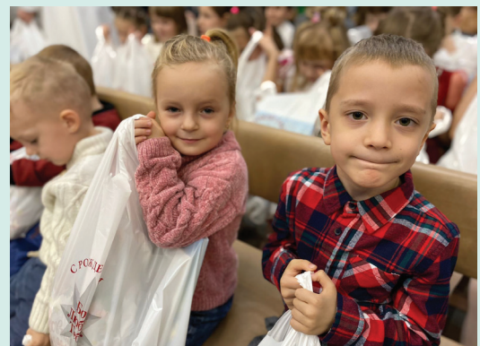
Children attend an Immanuel's Child Christmas outreach.

We're expecting a record number—at least 60,000 children! Your faithful support makes so much more possible—distribution of Russian-language Bibles and Christian literature, doctrinally sound Bible training, Compassion Ministry, children's ministries, and missionary pastor support. Please prayerfully consider how you can help today! ♦