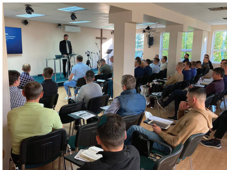
Irpen Biblical Seminary has reopened and students are attending classes.

In addition to the worship center, the kitchen and library sustained relatively minor damage compared to the upper floors of the school, and the students are meeting for classes on the first level, with 50 students attending each session. We praise and thank our God for His protection and provision, and you—our faithful partners—for your prayers and support.