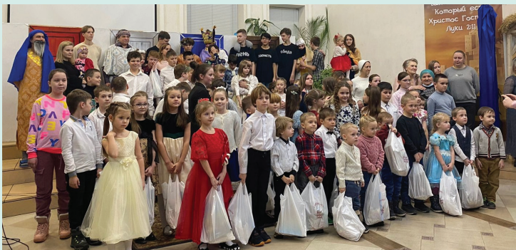
Children at an Immanuel's Child Christmas outreach.

But in addition to financial support, prayer is just as important. So as we celebrate the 20th