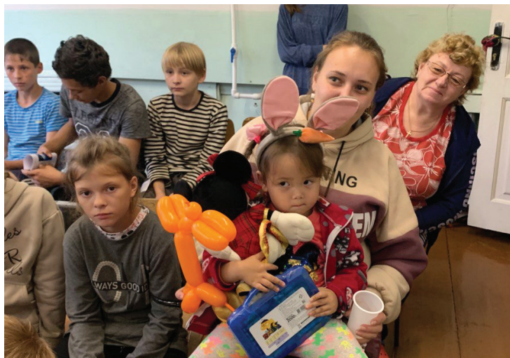
The program was attended by many children and adults.

Unknown to us at the time, God had other plans for us and for the director of the school. Upon our arrival at the village, which was delayed by a couple of days due to weather, we came to the place of our lodging. To our great surprise, the director of the school met us at the lodge as we drove up. She explained that because of poor weather conditions the scheduled helicopter (the only means of transportation in and out of the village) had not come for the last two weeks, and she was not able to leave as planned. She invited us to hold the outreach at the school, and after seeing the condition of the club house, we gladly agreed!