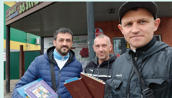
Believers share the Gospel and distribute New Testaments and Christian literature.

As winter deepens across the former Soviet Union, SGA partners faithfully help provide the resources needed for evangelical churches to reach needy individuals and families with warm clothing and other aid. Most importantly, God uses these timely gifts to open the door to lovingly sharing the hope of the Gospel. Your ongoing prayers and support do this and so much more, including provision of vitally important Bible training, Russian-language Bibles and evangelistic Christian literature, support of children's ministries, and youth ministry. And lives are being changed as a result for the glory of Christ. Please pray about how you can help today. ♦