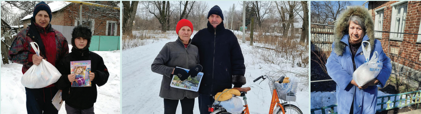
Above: Families gratefully receive warmth packages during the cold winter.

As winter deepens across the former Soviet Union, SGA partners faithfully help provide the resources needed for evangelical churches to reach needy individuals and families with warm clothing and other aid. Most importantly, God uses these timely gifts to open the door to lovingly sharing the hope of the Gospel. Your ongoing prayers and support do this and so much more, including provision of vitally important Bible training, Russian-language Bibles and evangelistic Christian literature, support of children's ministries, and youth ministry. And lives are being changed as a result for the glory of Christ. Please pray about how you can help today. ♦