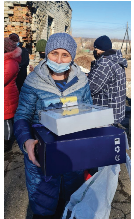
Above and Top: People are grateful to receive winter warmth kits.

In addition to Ukraine, deep needs such as this exist across many regions of the former Soviet Union such as Central Asia—where countries like mountainous Tajikistan and Turkmenistan are located. As this winter continues, please lift up the faithful pastors and churches as they minister to the needs of their people and share Christ's love. Also pray for the increased resources needed due to the demands created by the war in Ukraine. We praise and thank the Lord for each of you—our faithful partners—and for all that you help accomplish for the glory of Christ! ♦