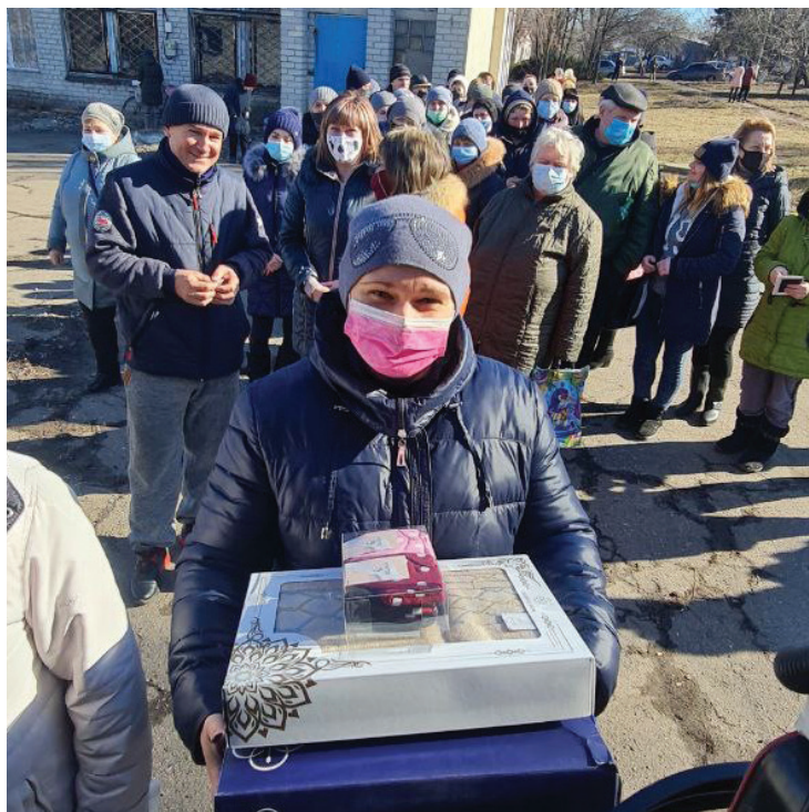
Above and Top: People stand in line to receive aid.

My help comes from the Lord, who made heaven and earth (Psalm 121:2).