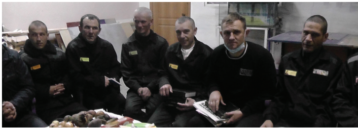
Prison Bible study group.

Brothers and sisters, I greet you in the name of our Lord Jesus Christ! I recently finished serving my fifth prison sentence in a facility near the Russian city of Novosibirsk. I wanted to give my testimony and share with you what God has done in my life. I just pray that my story will be useful for the newly saved, as well as for those who have not repented before God yet.