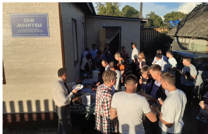
Fellowship at the dedication of the House of Prayer.

people, inviting them to the church and telling them about Christ. And beginning this month, I plan to start a new group of preparation of new brothers for ministry in churches, following the program "Fellowship around the Word." Please pray for this new group of brothers who are preparing for ministry.