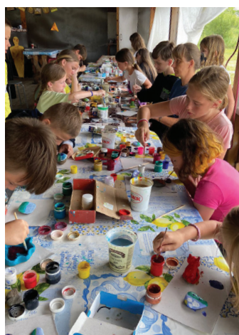
Making crafts at the camp.

SGA-Sponsored Missionary Pastor in Far East Russia