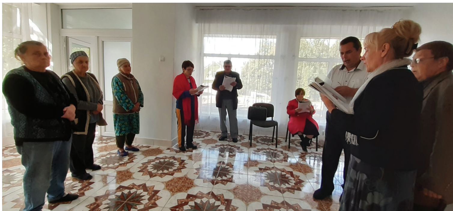
Service in the nursing home.