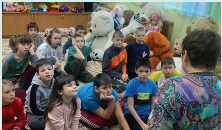
Orphans Reborn volunteers teach Bible lessons during visits to orphanages.