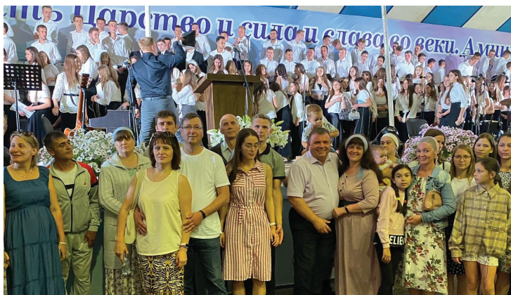
Festival of Music and Word in Bryansk.

We taught the children how Joseph remained faithful to God despite the betrayal of his brothers, the misunderstanding of his parents, slavery, deceit, prison, and even after assuming a high position in the government of Egypt. Joseph was always faithful to God! God blessed us in a special way with this ministry to children. There were 162 children from the ages of 7 to 13 who took part in the outreach. They came from the Lipetsk region, as well as from the Voronezh, Belgorod, and Tambov regions. Bible classes were the basis and we pray, asking the Lord for the opportunity to have a similar outreach again this year!