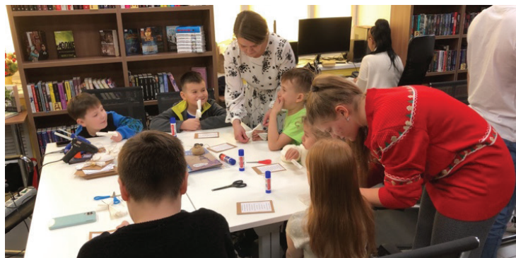
Event at the central library.

Please, pray for our church's ministry team. We have a shortage of workers right now, and those who are in the ministry are overwhelmed. Pray as well for a more reliable vehicle for ministry travel. Thank you once again for your prayers and participation. May God bless you and your ministry, and may He reward you for your sacrificial hearts! ♦