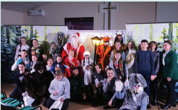
Christmas outreach for children with special needs.

As we see so often, fruit from one ministry often leads to even more opportunities later,