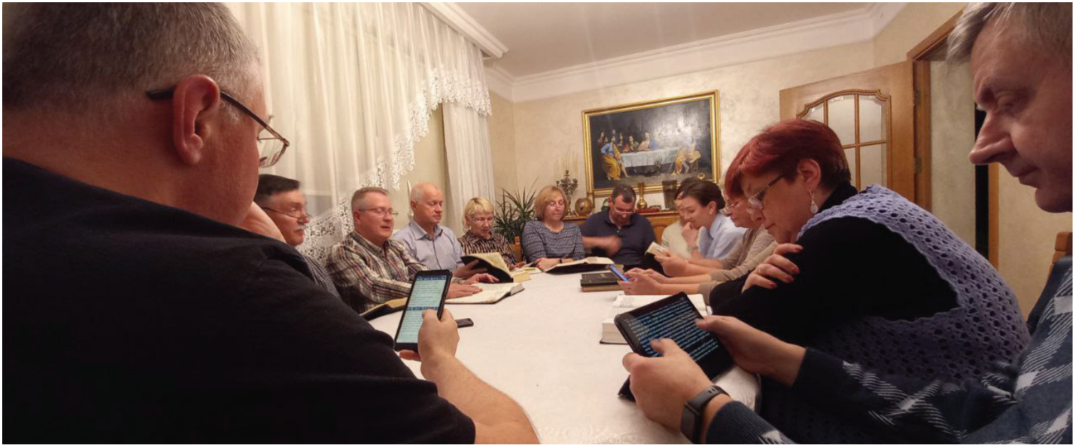
Home group Bible study.