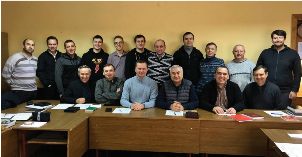
Meetings continue despite the war.

Be anxious for nothing, but in everything by prayer and supplication with thanksgiving let your requests be made known to God. And the peace of God, which surpasses all comprehension, will guard your hearts and your minds in Christ Jesus (Philippians 4:6-7).