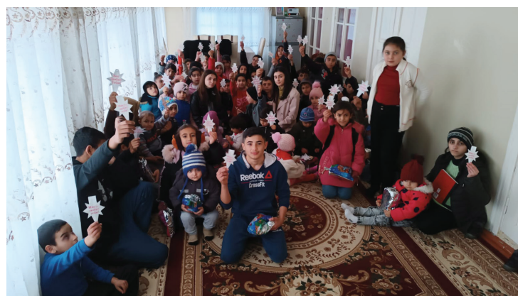
Immanuel's Child celebration in Azerbaijan.