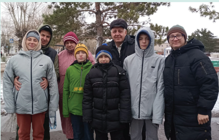
Hosting refugees from Russia.

Also, my sons and I delivered sacks with potatoes to needy families. All were grateful for our care for them and the gift. When needy families come, brothers and sisters in the church are always ready with cooking and fellowship. We praise God for them! Please join us in praying for everyone who was with us and heard the Good News. Pray that they will believe and follow Christ! ♦