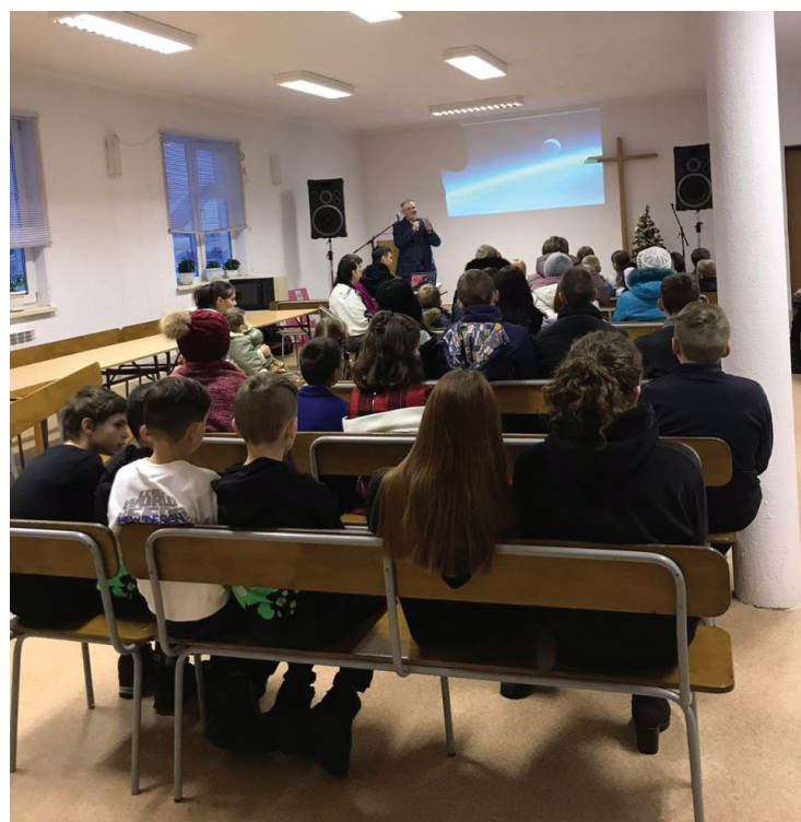
Teaching foster children and their parents.

God, people are still coming and have not lost interest! Some of the adults came with their children for the first time to the Sunday worship service. We continue this ministry and hope to see more fruits from it.