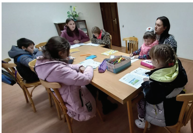
Sunday school with new children.

M y heartfelt thanks to you, my dear friends and workers in God's field! My family and I cannot stop thanking God for your sacrificial hearts, constancy, and sacrifice. Even in difficult times, you have remained faithful and dedicated to the preaching of the Gospel, and because of you we are able to do ministry in our country.